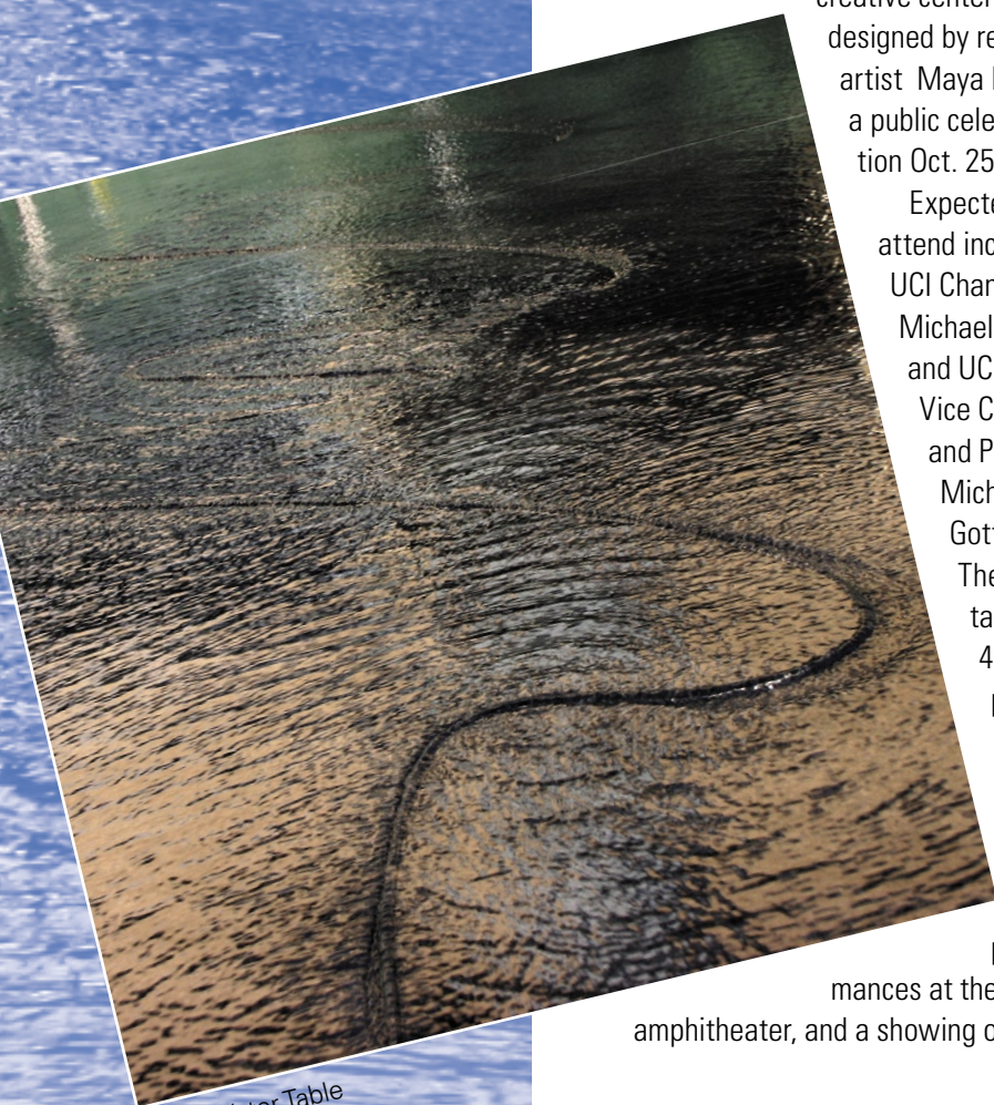
Arts Plaza Water Table