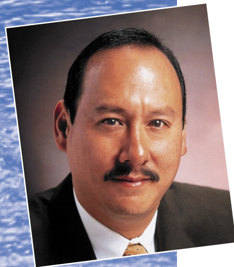
Michael Ramirez

He continues, "We're not out to get personalities, we're out to attack issues. And if those personalities happen to support issues that we don't, we get them both."